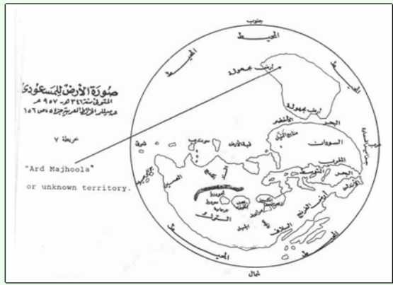
Ancient map of the world by Al-Mas'udi (10th Century C.E.), "Ard Majhoola" refers to the Americas

These references and more all point to what the non-expert activist dismissed as "wish-fulfillment". On the contrary, ancient Arabic language maps, Native American tribes with African names and words clearly embedded in their languages, statues, diaries, artifacts, etc. destroy European imperialistic notions of history rooted in White Supremacy. One such notion is that African peoples' history in America begins with slavery.